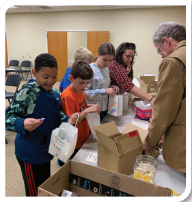
The Children's Ministry at Knollwood Baptist Church prepared 100 health care kits for us to share with pharmacy patients.

groups, giving tours to community members, collaborating with other organizations, and learning more about our donors this time of year. THANK YOU from the bottom of our hearts for choosing to support the work we do. We would not be able to assist neighbors through their crisis without your help.