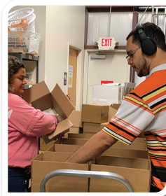
Volunteers enrolled in the Positive Path Program through the City of Winston-Salem helped sort 400 boxes of cereal for CCM to share with the WSFC Public School System. The group also helped pack 125 food boxes distributed at the Imprints Cares holiday party.