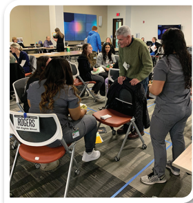
More than 30 volunteers helped facilitate two poverty simulations for 82 Physician Assistant Students at Atrium Wake Forest Baptist Medical School.