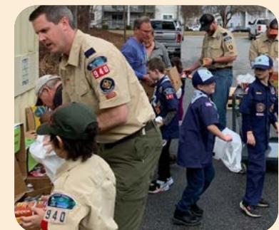
Scouting for Food 2024