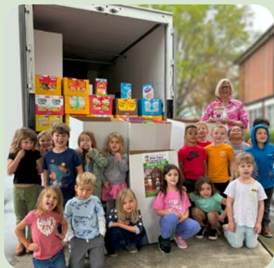
Pictured above: Sedge Garden United Methodist Preschool collected an entire truckload of cereal, 1,147 boxes.

During the month of March, more than 10,000 children at 65 schools across Forsyth County participated in the Wee Care! Cereal Drive. This is a program that not only collects cereal donations, but helps preschool and elementary school-age children learn about the importance of sharing and being a good neighbor.