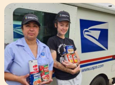
Kernersville Letter Carriers

Saturday, May 11, marked the 30th Anniversary of the National Association of Letter Carriers Stamp Out Hunger® Food Drive. This year, the letter carriers of Kernersville's zip code 27284 donated more than 7,000 pounds of non-perishable food items to our Kernersville pantry.