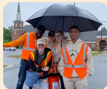
Elevation Church Volunteers

May 3 and 4, Main Street United Methodist Church and S&R Motors generously donated the use of their parking lots to Crisis Control Ministry as a fundraiser. Even the rainy weather did not dampen the spirits of dedicated volunteers who helped park and collect donations. More than $3,600 was donated.